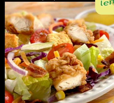
Southern Fried Chicken Salad